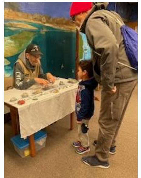
Just for You