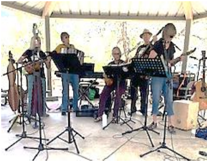
Skeleton Crew Brew