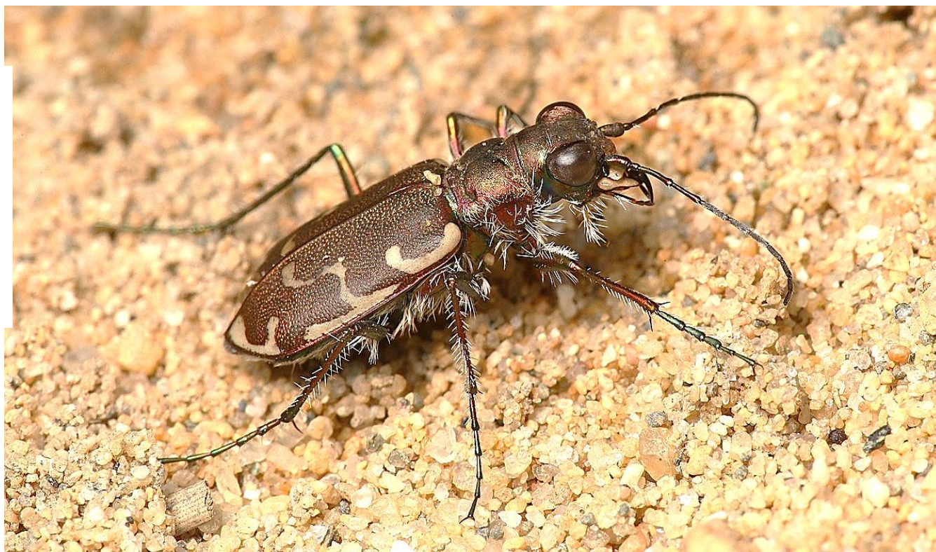
Bronzed Tiger Beetle Cicindela repanda

Friends of the Rio Grande Nature Center • Rio Grande Nature Center State Park 2901 Candelaria NW • Albuquerque, NM 87107 • Tel: (505) 343-1373 Web: rgnc.org • E-mail: friends@rgnc.org