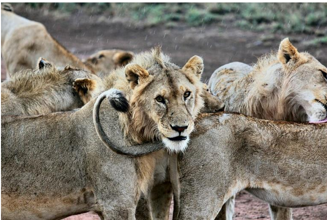
Numbers going down ...